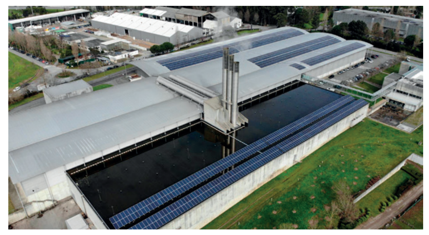
We recycle up to 60,000 metric tons of organic waste at the composting plant in Portugal.